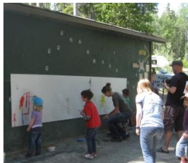
Kids Corner, Open House

Summer is here!... or so says the calendar, anyway. It's been a cool summer so far in the Golden area, but we've been busy with our wolf pack and our many visitors! We were lucky enough to get a sunny, hot summer day for our annual OPEN HOUSE, which was another great success!